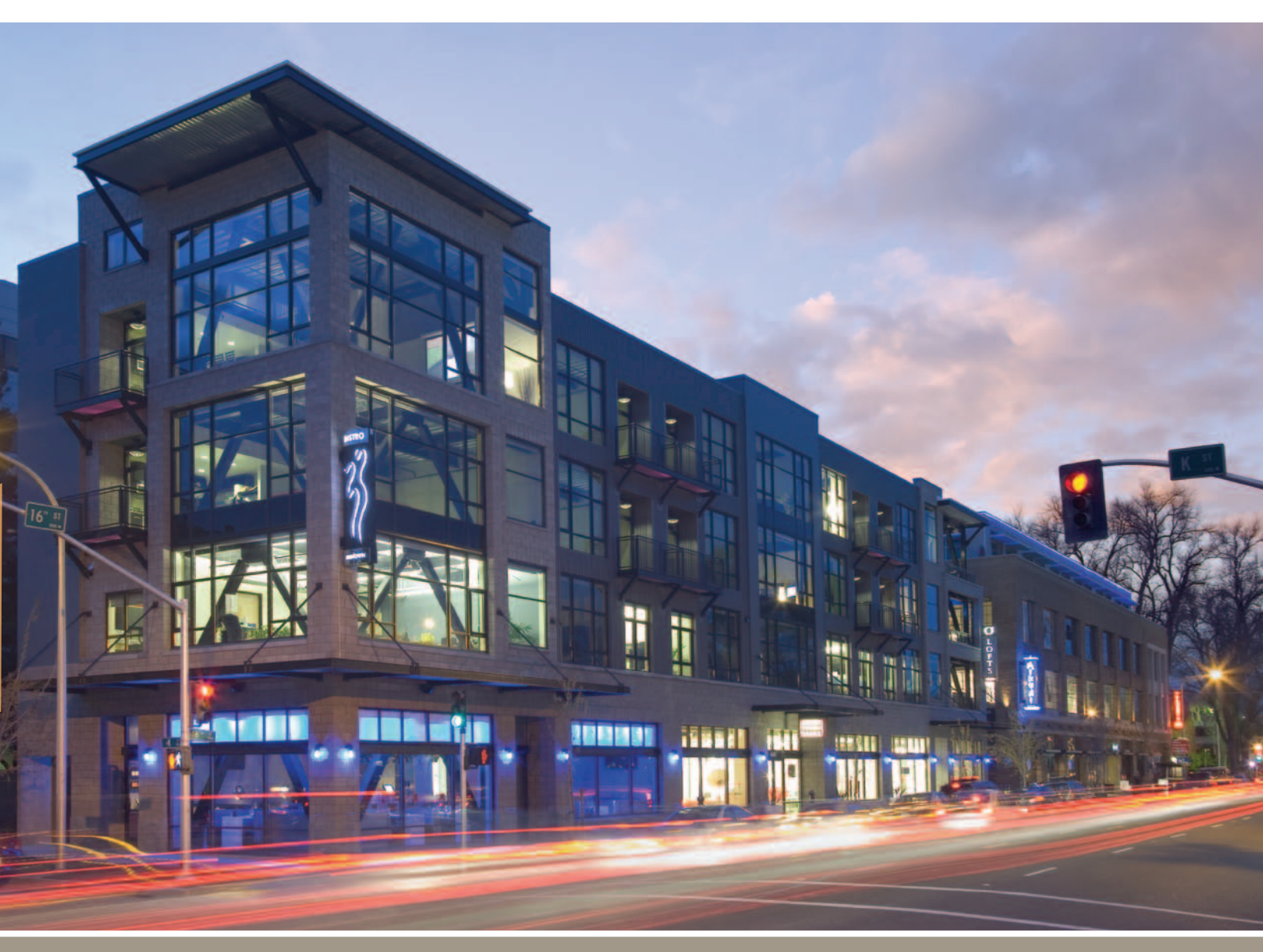
Midtown Retail Portfolio O1 Lofts